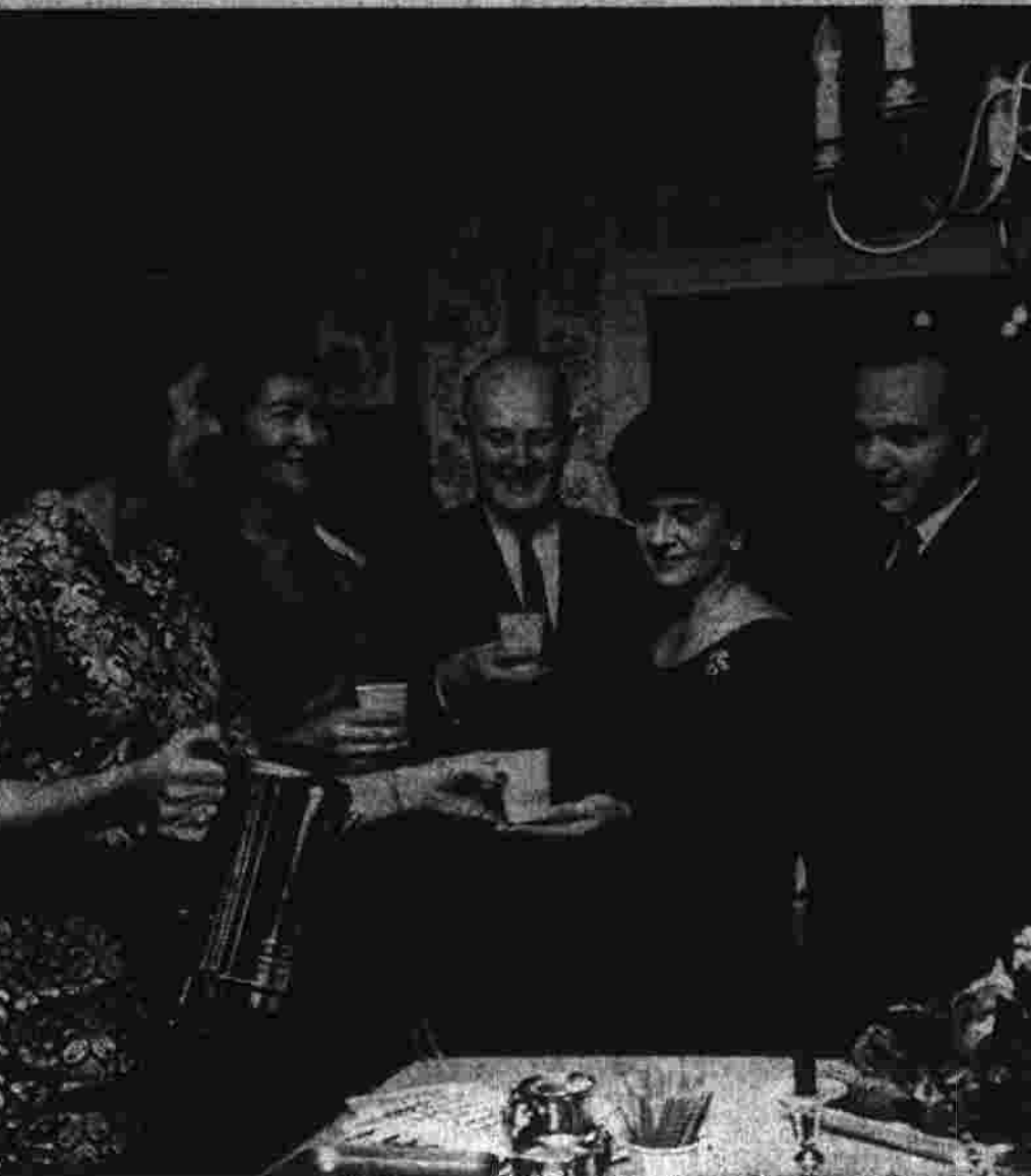
Dark, and with Two Sugars, Please